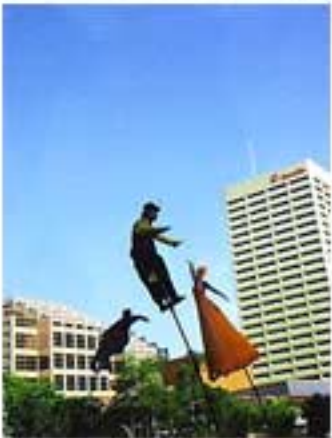
1st Place Colour Sieg Koslowski's pix of street performers captured first for the summer project, Wind.