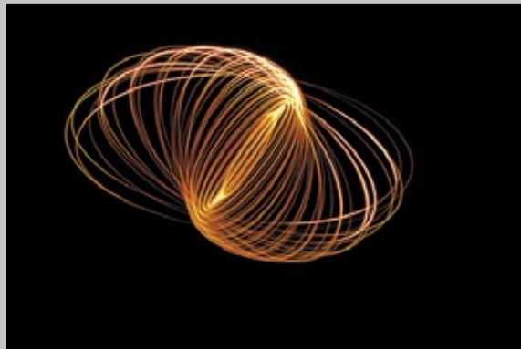
Second place slide, May.