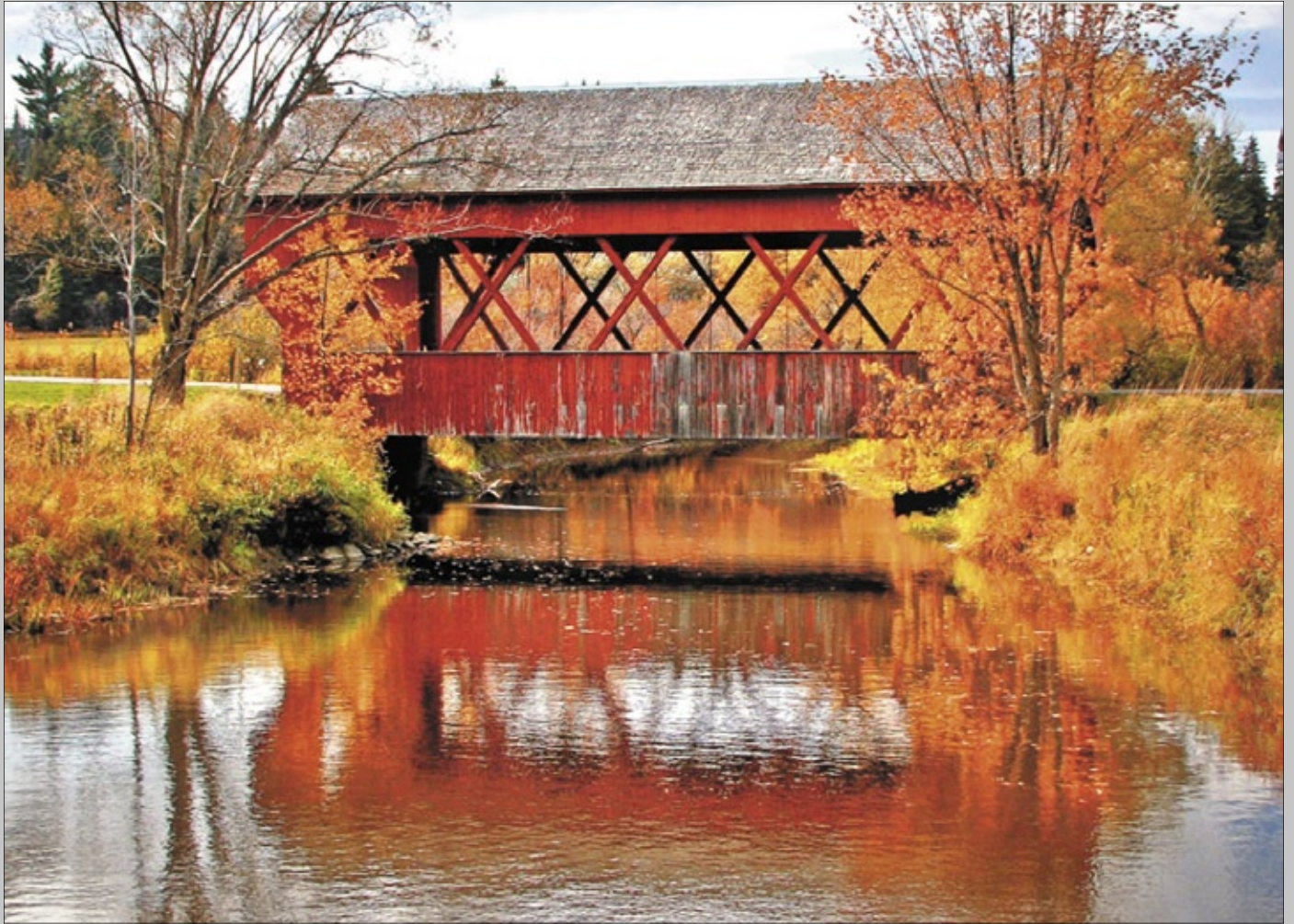
First place print, April.