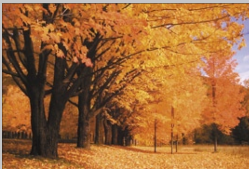
First place print, January.