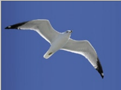
Second place print, October.